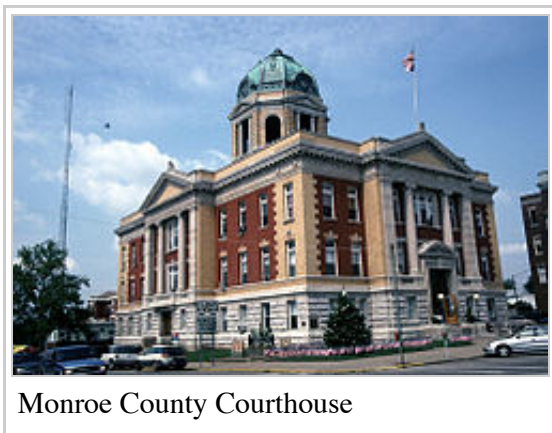
Monroe County Courthouse

There were 6,021 households out of which 29.50% had children under the age of 18 living with them, 61.70% were married couples living together, 8.10% had a female householder with no husband present, and 26.70% were non-families. 24.00% of all households were made up of individuals and 11.50% had someone living alone who was 65 years of age or older. The average household size was 2.50 and the average family size was 2.96.