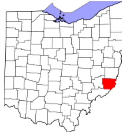
Location in the state of Ohio