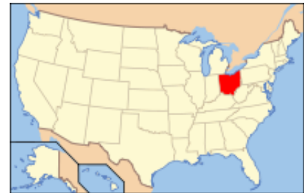
Ohio's location in the U.S.